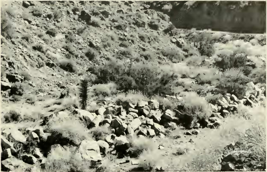
Figure 4. Nelson Mountains, Grapevine Canyon. Elevation 5000 feet. Station 14. March 1959. "Pitfall" traps were located in the gravelly alluvium at the base of the piled boulders. A young adult male of Gerrhonotus panamintinus was obtained here on June 14, 1960. See plate 1 (CAS 89675).

Other stations in Grapevine Canyon, which vegetationally closely resembled the type locality in Surprise Canyon, but which did not yield specimens of G. panamintinus , were Station 9 (elevation 5320 feet), Station 16A (elevation 4860 feet), Station 21 (elevation 4480 feet), and Station 25 (elevation 4030 feet). However, each of these stations did yield a moderate number of specimens of Sceloporus occidentalis longipes and Eumeces gilberti rubricaudatus .